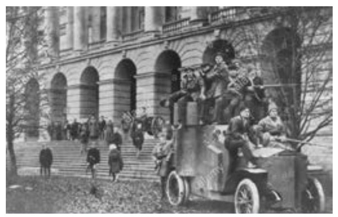
Red Guards in Front of Smolny

On that night the revolutionary workers, soldiers and sailors took the Tsar's Winter Palace by storm and arrested the Provisional Government. The armed uprising in Petrograd had won. At ten p.m. that very night the Second All-Russian Congress of Soviets opened in the Smolny after the power had already passed.