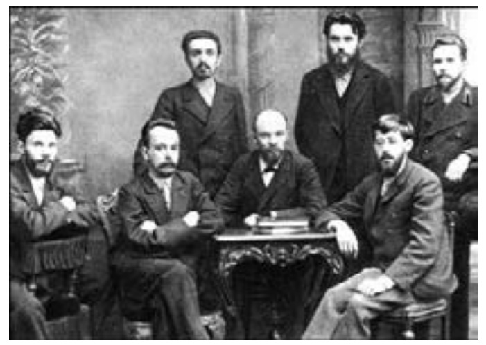
Leaders of St. Petersburg League of Struggle

idea that workers were only capable of fighting for their immediate economic demands and certainly not capable of leading the peasant masses in a successful political struggle for the overthrow of the powerful tsarist state.