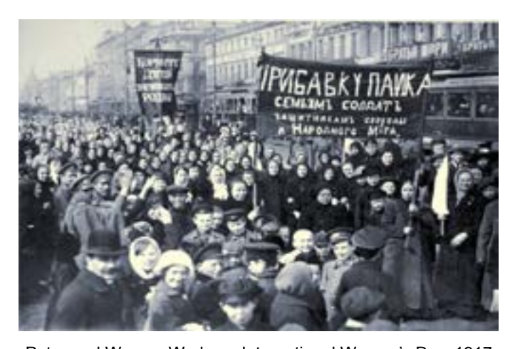
Petrograd Women Workers, International Women's Day, 1917

On February 18, 1917 (old calendar), a strike broke out at the Putilov Works in Petrograd. Four days later, the workers at most large factories were on strike. The next day, International Women's Day, at the call of the Bolshevik City Committee, working women came out in the streets to demonstrate against starvation, war and tsardom, backed by a city-wide strike movement. By February 25 the whole of working-class Petrograd (St. Petersburg) had joined the revolutionary movement. The political strikes in the districts merged into a general city-wide political strike. By the next morning the political strike and demonstration began to assume the character of an uprising. The workers disarmed police and armed themselves.