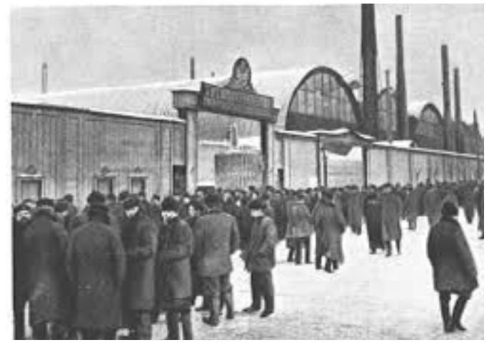
Workers on Strike at Putilov Works

dissatisfaction of the Russian masses, exacerbated by the war, was threatening to re-establish on an even more acute basis the revolutionary situation that had been interrupted by the First Imperialist World War. The most overwhelming mass demand was for peace , that is, for Russian withdrawal from the imperialist war.