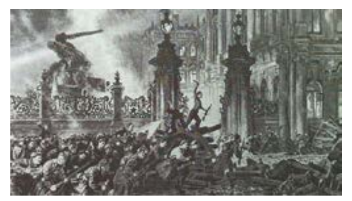
Storming of the Winter Palace

On that night the revolutionary workers, soldiers and sailors took the Tsar's Winter Palace by storm and arrested the Provisional Government. The armed uprising in Petrograd had won. At ten p.m. that very night the Second All-Russian Congress of Soviets opened in the Smolny after the power had already passed.