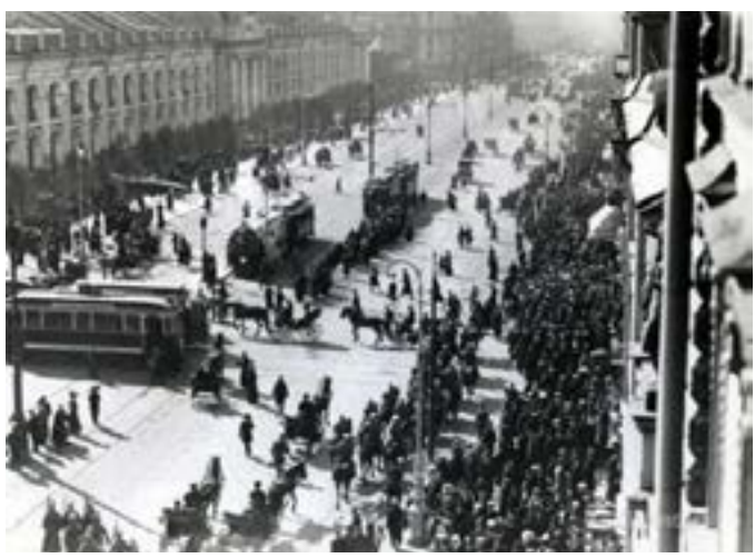
St. Peterburg Demonstration Against the Lena Massacre

The real rise in the revolutionary movement began in April and May 1912 when mass political strikes broke out in connection with the shooting down of workers in the Lena goldfields in Siberia. Of the six thousand striking Lena miners, over 500 workers were killed or wounded upon the orders of a tsarist officer of the gendarmerie. This new bloody deed of the tsarist autocracy in service to the British capitalist masters of the Lena goldfields was committed to break an economic strike of the miners. The shooting down of the unarmed Lena miners attempting to peacefully negotiate with company management stirred the whole country.