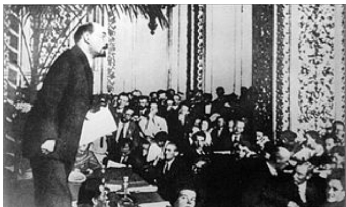
Lenin Speaking at the Third Congress of the Comintern

The First Congress of the Communist International was held in Moscow from March 2-March 6, 1919. There were 35 delegates from 19 parties and organizations with voting powers and 19 delegates from 16 organizations with a consultative voice. At the Second C.I. Congress, held in 1920, the International "adopted terms of admission which required that all decisions of the Comintern are binding on all affiliated parties." However, it included the need "to take into account the diversity of conditions in which the various parties have to fight and work and to adopt decisions binding only on matters in which such decisions were possible." (Jose Maria Sison, Impact of the Communist International on the Founding and Development of the Communist Party of the Philippines , 2006) Thus, from 1920 until its dissolution in 1943, the Comintern functioned as a world communist party.