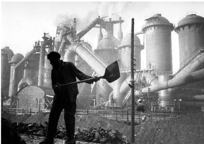
Magnitogorsk Iron and Steel Works 1930

The chart on page 259 takes the same five countries and the same five years but makes the reference point a sixth year, the prewar year of 1913 . In this chart, examining the year 1933, for example, Germany's and England's percent compared to their respective 1913 volumes are both less than 1913 (75.4 percent and 85.2 percent respectively), while the French and U.S. 1933 volumes (107.6 percent and 110.2 percent respectively) are slightly greater than their 1913 base volumes. Meanwhile, the USSR's number is 391.9; this means the USSR's volume of industrial production is almost four times greater than it was in 1913. These charts show, as Leontiev states, "While there is a considerable increase of production in the USSR every year, the capitalist world, caught in the iron vice of the crisis, curtails production to an unprecedented degree." (Leontiev, p. 258)