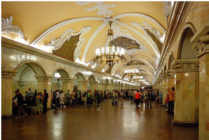
World Renown Soviet Metro

Among other points, comrade Foster cites, "the general rise in Russian living standards ... manifested by a large increase in consumption of the more nutritious foods." (p.106) Regarding education, Foster notes: "One of the great achievements of this vast work is the rapid wiping out of illiteracy. In 1913 only 25% above the age of 10 could read; 90% of women were illiterate. Illiteracy has now been practically eliminated from the industrial centers and it will also soon go from the villages." (p. 110 and 111) And "the Russian revolution is giving the greatest stimulation to science, literature, music, the theatre, etc. that the world has ever known." Foster cites the famed journalist, Walter Duranty of the New York Times (December 1, 1931), as follows: "There seems to be no parallel in history to the drive for learning in all branches of knowledge, from reading and writing to the abstruse sciences, now in progress in the Soviet Union."*