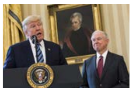
Attorney General Sessions & Pres. Trump

he persists in making very public and sustained criticisms of the openly white supremacist Attorney General he himself appointed to head the Justice