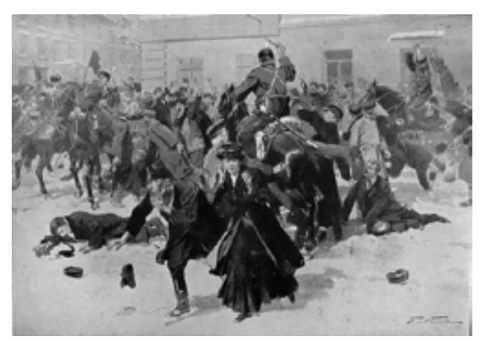
Baku Oil Workers Strike

In December 1904, there was a huge, well-organized strike in Baku, led by a Bolshevik Committee. The strike was victorious and the resulting collective agreement concluded between the oilfield workers and the owners