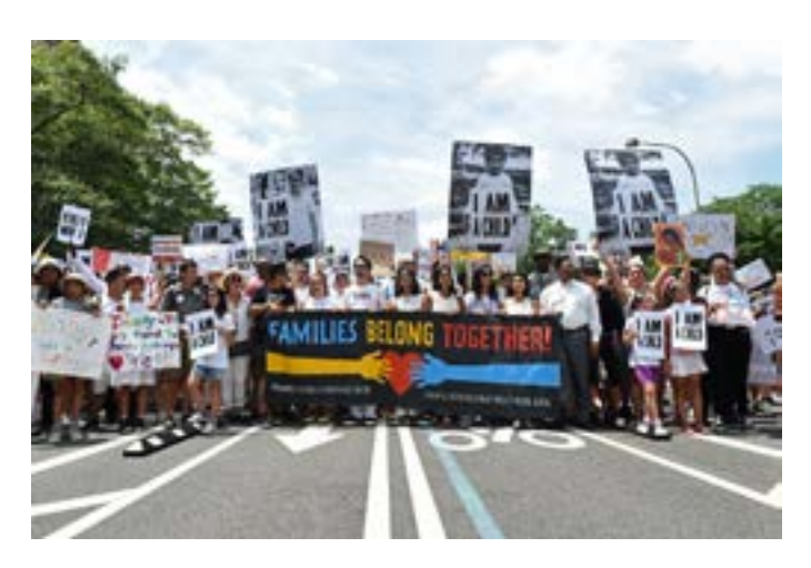
The other sectors of the U.S. multinational working class and the 90% of us need to build on our June 30

There is no doubt that the Trump Regime is pursuing a German Nazi style scapegoating of various nonwhite peoples within the USA. And the vicious and fascist assault on immigrant children and families is a significant feature of this chauvinistic campaign.*