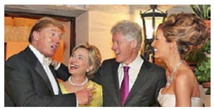
War Criminals of a Feather

Venezuela and standing with an illegitimate president is so hypocritical, it goes beyond the definition.