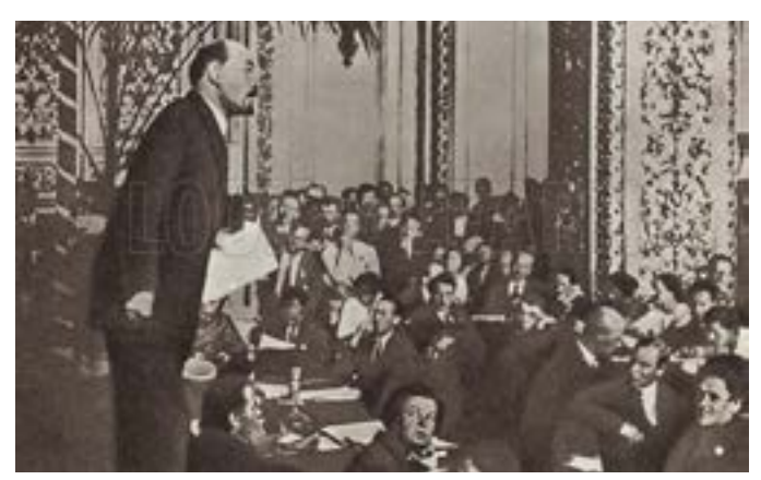
Lenin speaking at 3rd Congress of Communist International

"From the standpoint of preserving the Republic of Soviets itself:' In the midst of the Civil War and Imperialist Intervention (1918-1921) the Communist International was established on the soil of the Soviet land under attack from all sides, and under the leadership of the Bolshevik-led government that was the main target of the attack! What Leninist boldness and vision! As the authoritative History of the CPSU(B) points out, 'The Red Army was victorious because the Soviet Republic was not alone in its struggle against Whiteguard counter-revolution and foreign intervention, because the struggle of the Soviet government and its successes enlisted the sympathy and support of the proletarians of the whole world. While the imperialists were trying to stifle the Soviet Republic by intervention and blockade, the workers of the imperialist countries sided with the Soviets and helped them. Their struggle against the capitalists of the countries hostile to the Soviet Republic helped in the end to force the imperialists to call off the interventions." ("October Revolution and the Communist International," ibid .)