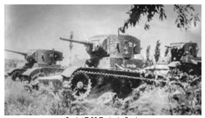
Soviet T-26 Tanks in Spain

Soviet government has saved the government in Madrid which everyone expected to collapse,' concluded the undersecretary of state at the foreign office. 'The Soviet intervention has indeed completely changed the situation.'" (p. 352)