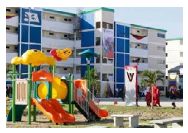
Some of the nearly 3 million low-income housing units built in Venezuela

totally responsible for the "failed economic policy" the authors lament in the second paragraph. Of course, that sentence is an attack on socialism and the very fact that even in the crisis, the people of Venezuela are housed and they are fed — unlike the gross policies of the imperialistic government that Khanna and Jayapal represent. Here, in the wealthy U.S. about one million children go to bed hungry every night and the Trump regime and its "left cover" dare to criticize Venezuela?