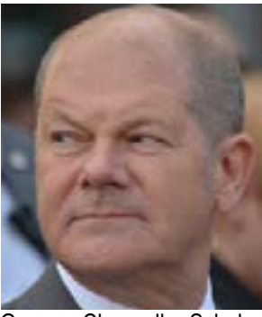
German Chancellor Scholz