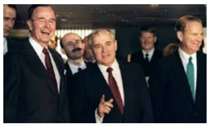
From left, Bush, Gorbachev, Baker

since the September 1990 treaty was signed. It turns out that treaty only addressed how NATO troops could operate in the territory of the former East Germany.*