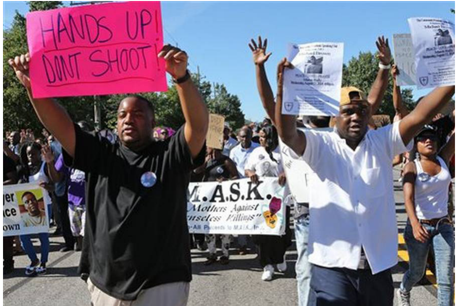
In the Streets of Ferguson, Missouri

On August 9 th , in broad daylight, Ferguson, Missouri policeman Darren Wilson shot to death Michael Brown, an unarmed eighteen year-old Afro-American youth who had his hands up in the air! In this white supremacist society, Brown's apparent "crime," like Trayvon Martin and so many other Black youth in these times, was walking while Black! In this city of twenty-two thousand, two-thirds of the population is Afro-American, while the police force is almost lily-white. Reflecting cold disrespect for the youth, his family and his people, the cops left Brown's body in the middle of the street for hours. There was a days-long delay in even naming Wilson as the killer cop. Clearly, the national oppression of the Afro-American people was at the heart of this tragedy. And the community responded with angry protests.