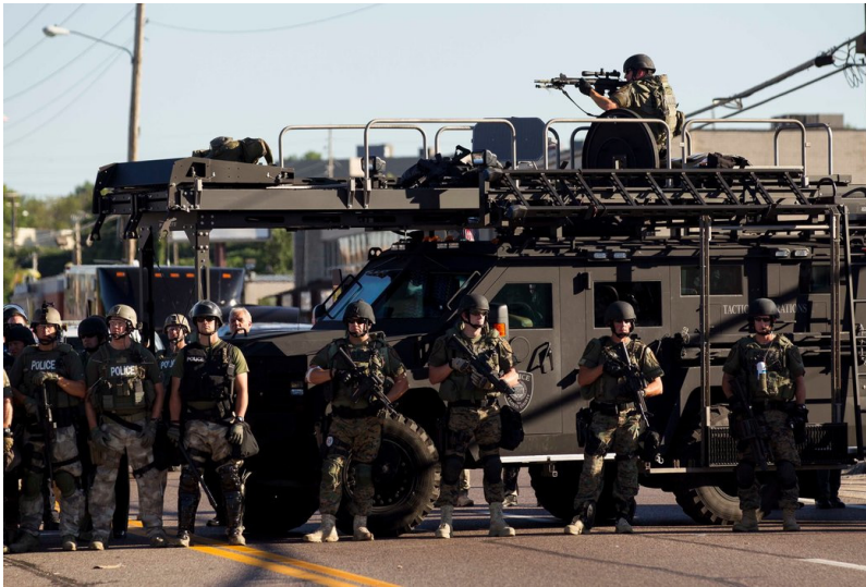
Military Occupation of Ferguson, Missouri

We, the 99% in the USA, and especially the workers and the Afro-American people and other oppressed nationalities, need to recognize that we have been siding with our enemies, imperialism headed by U.S. imperialism, and we have opposed our friends and allies, the international working class and oppressed peoples in the Middle East and around the world. Ten years ago, when the Iraqi Resistance was waging a powerful war of liberation against the U.S. occupation army, Afro-American soldiers and recruits stopped enlisting and re-enlisting, as did Latinos to a lesser extent. Several U.S. military services had to resort to “stop-loss” orders compelling soldiers to remain in the military after their