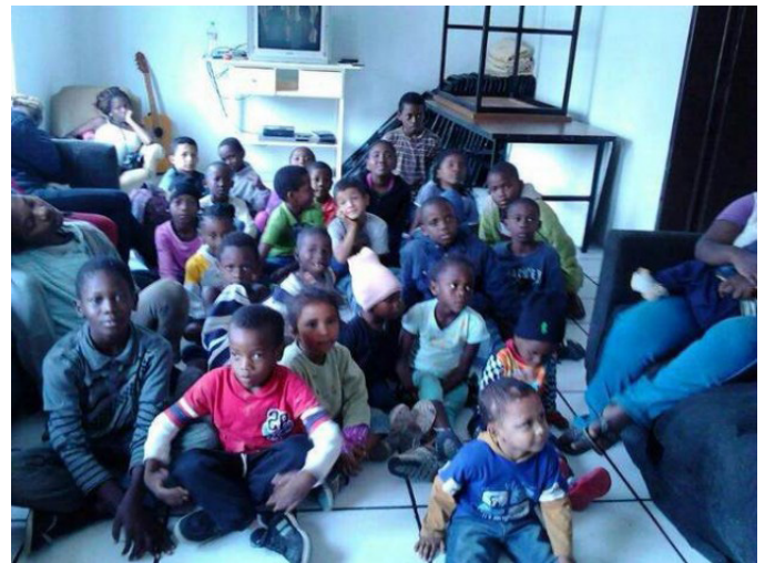
Garifuna children from Honduras on route to U.S.