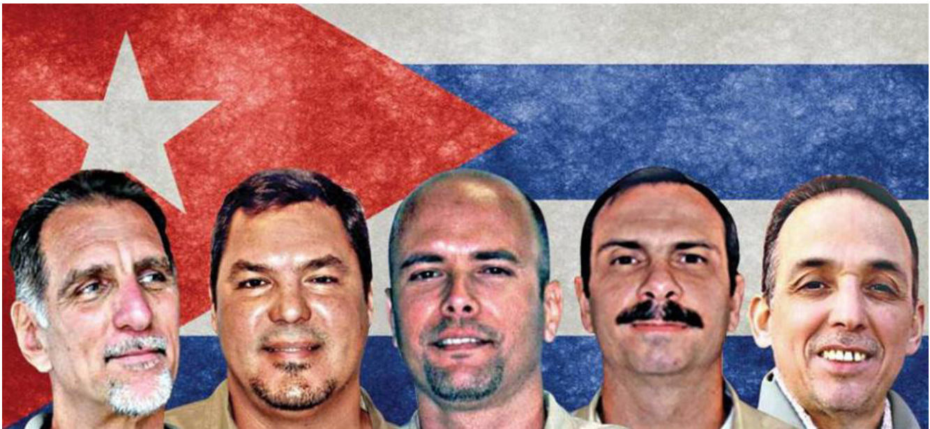
“The Cuban Five”

I have always felt safe in Cuba. This past year the US itself is going up in flames over police violence and crackdowns on our freedom of speech. The US incarcerates more people per capita than any other nation in the world. Cuba has one of the best healthcare systems in the world and is near the top for literacy rate. Cuba sent doctors to West Africa during the Ebola crisis and the US sent troops. Typical, huh?