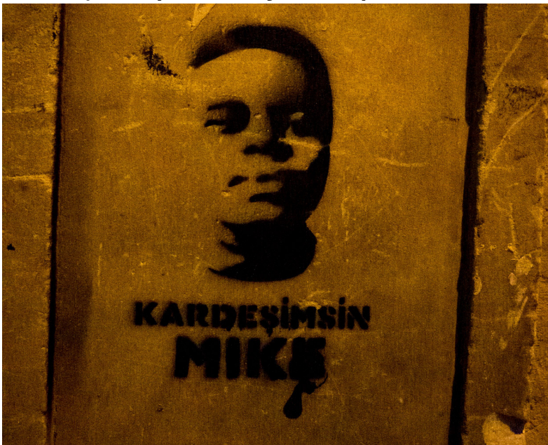
Proletarian Internationalist Solidarity with the People of Ferguson, Missouri from Comrades in Istanbul, Turkey

one in authority in the U.S. government has been held accountable for torture, asserts further (echoing the sentiments of comrade Sison) that, “impunity has been virtually guaranteed” by “golden shield’ legal memos written by government lawyers for the CIA; ex post facto immunity for war crimes that Congress inserted in the 2006 Military Commissions Act; classification and secrecy that still shrouds the torture program, as is apparent in the Senate report’s redactions; and the ‘look forward, not backward’ position that President Obama has maintained through every wave of public revelations