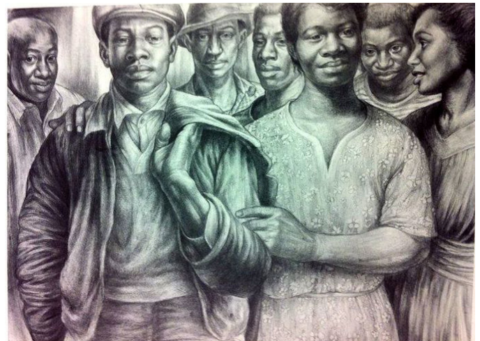
“Walk Together” by Charles White

Let’s contrast the words and message of “Amazing Grace” with another religious anthem, widely considered the Afro-American national anthem, “Lift Ev’ry Voice and Sing.” “Lift Ev’ry Voice and Sing” was written by James Weldon Johnson, a novelist and poet, a diplomat and teacher, and the first Black executive of the National Association for the Advancement of Colored People (NAACP) at the beginning of the twentieth century. This anthem which was set to music by his brother, J. Rosamond Johnson, calls on the Afro-American masses to “march on till victory is won.” While referring to the strength of the “faith” that the “dark past has taught us” and “hope that the present has brought us,” there is no call for forgiveness of the enemies of the people . There is no call for unity with them. The anthem is a clear call for unity of the Afro-American masses (Lift every voice) in the struggle for “Liberty.” It is a religious song that calls on the Afro-American people to stand “True to our God” but the God portrayed by Johnson, in contrast to that of Newton, is a God of the “rising sun of our new day” of liberty for those who have been oppressed.