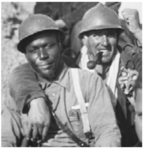
Oliver Law, 1st Afro-Am. to command white troops