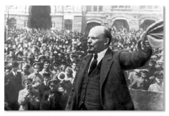
Vladimir Illyich Lenin, on the eve of the Russian Revolution, 1917.

following the dismantling of the socialist camp, it made it much easier for the imperialist masters to vanquish our struggles throughout the globe. As the international proletariat and oppressed peoples feel the intensified lash of imperialist exploitation and oppression, and increase their determination and resolve, they will come once again to discover the remarkable achievements of the first Socialist state, the USSR. And they will recognize the need to take the same path." ("The Revolutionary Significance of the Great October Socialist Revolution on its 90th Anniversary," Ray O' Light Newsletter #46, November-December 2007)