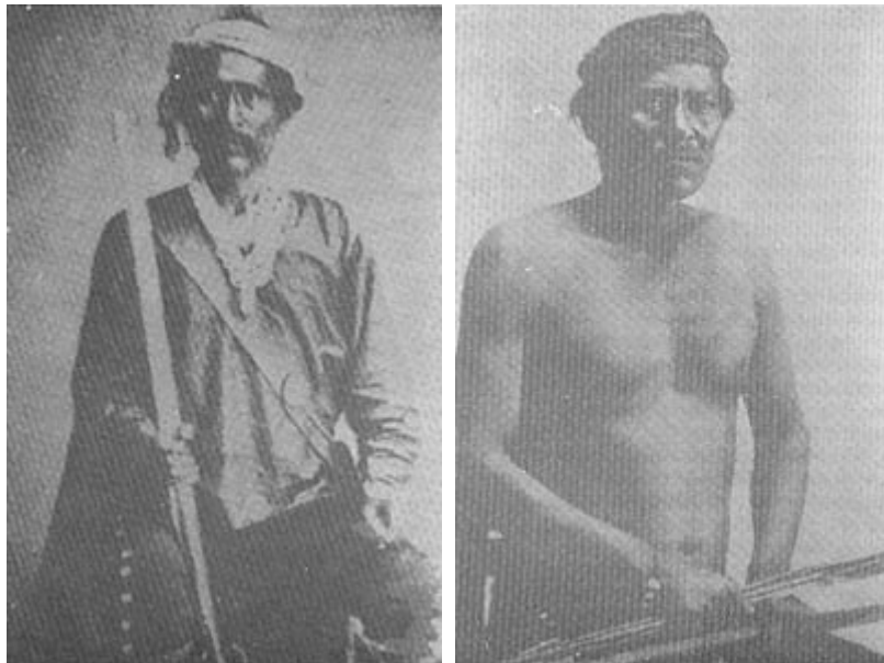
Diné leaders Barboncito (left) and Manuelito (right)

In 1899, the U.S. Secretary of the Interior was given the power to grant railroad right-of-ways through Diné territory. In 1900, public roads were added. In 1902, the telegraph came through and in 1910 telephone lines were strung up. In 1904 and in 1917, pipeline right-of-ways were authorized. Then in 1921 and 1922, critical events took place that were to drastically alter the lives of the Diné people: natural gas was discovered at Ute Mountain and oil was found near Shiprock. 6