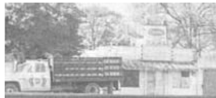
The air conditioning shop where Carleton Sanders was employed.

Don: "Yeah, scope out some places. We'll see you later."