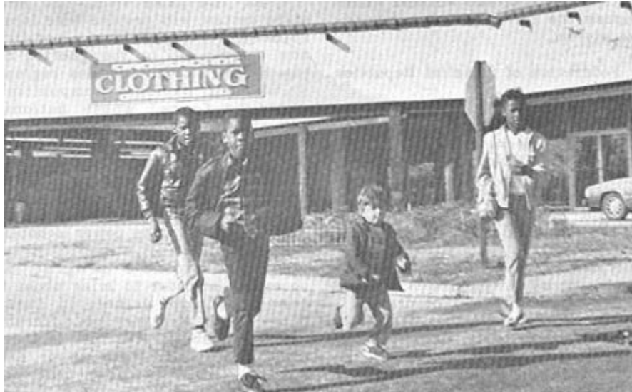
Children playing in the Atlanta shopping center where Lubie Geter was kidnapped. Afro-American children will only be free from racist terror once the system of national oppression has been abolished by means of revolution.