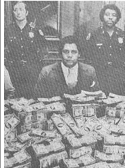
Maynard Jackson, who was Mayor of Atlanta, cynically offered $500,000 in reward money for the killers. Jackson and other officials knew who the killers were and allowed them to continue their murderous pogroms without interference.

Maynard Jackson, who was Mayor of Atlanta, cynically offered $500,000 in reward money for information about the killers. Jackson and other officials knew who the killers were and allowed them to continue their murderous pogrom without interference.