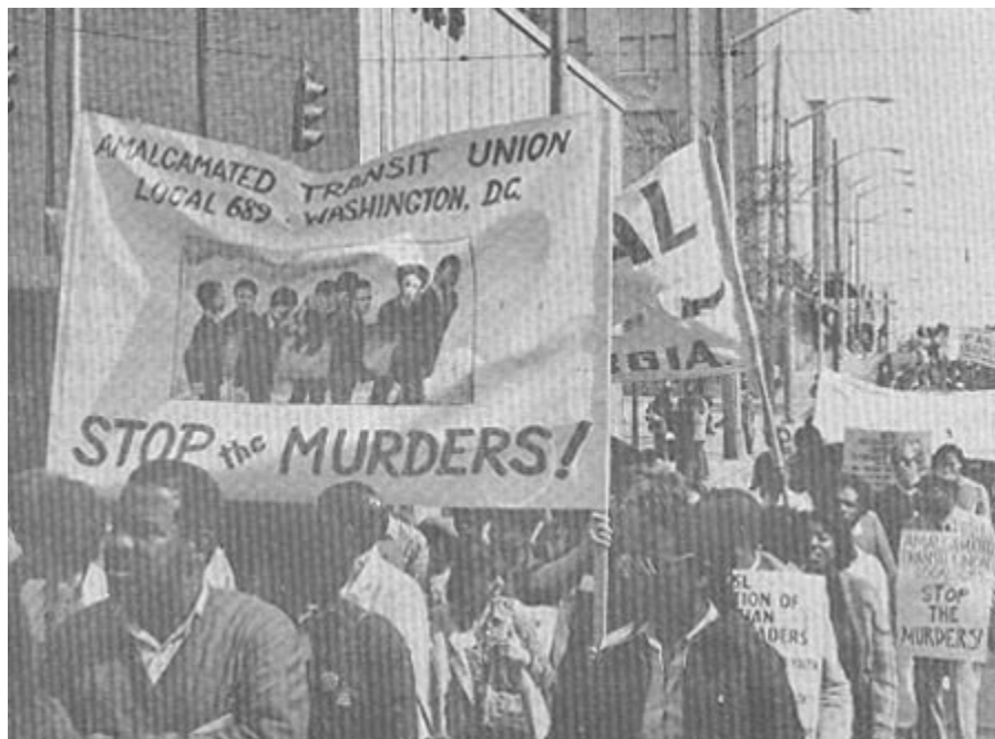
Workers march in Atlanta to protest the child murders, March, 1981.