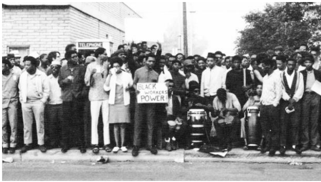
The Chrysler wildcat strike begins in Detroit, MI, 1968 led by the Dodge Revolutionary Union Movement (DRUM) an organization of Black revolutionary workers.