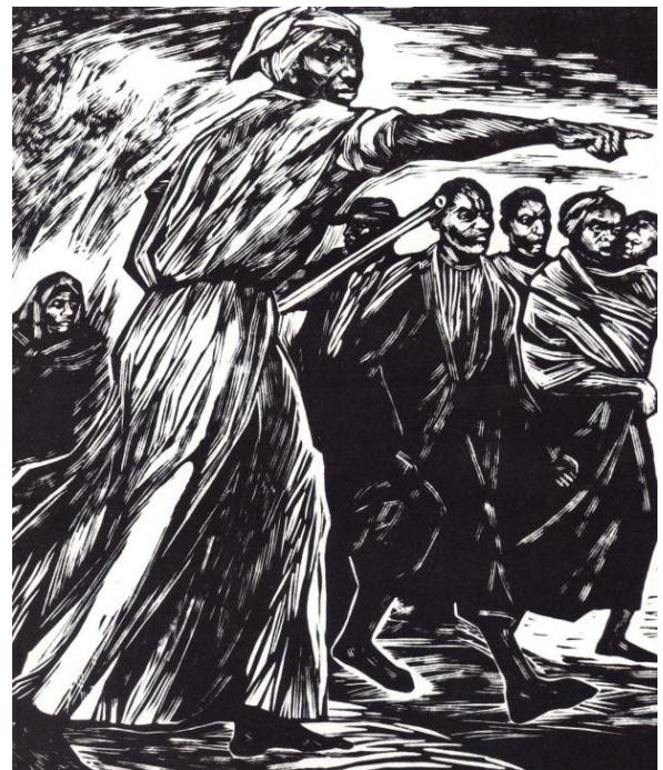
Freedom fighter Harriet Tubman (1822-1913) is depicted in an artwork “Harriet” by Elizabeth Catlett, 1975.

lions of captured Africans into the new world and the genocide of the indigenous nations who lived in the Americas.