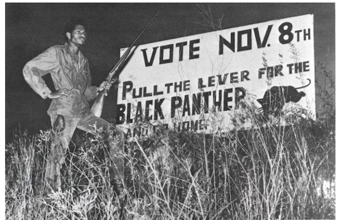
Election Night, Lowndes County, AL, 1966

By 1963 a more impatient mood had developed among the Black masses. Dr. King and the other civil rights leaders developed the March on Washington demanding equal rights and an end to discrimination. In the inner city ghettos, the voice and program of the Black nationalist and Black Muslim leader Malcolm X began to challenge the integrationist, non-violent civil rights leadership. Black rebellions broke out in city after city from 1963 -1970. The Black Panther Party exploded onto the scene, calling for revolution, and held the loyalty