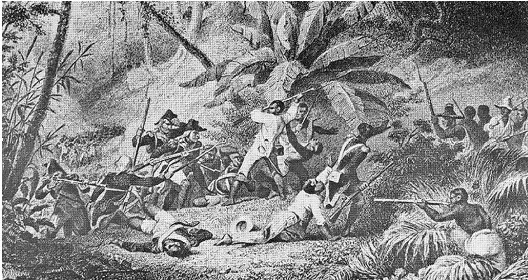
Revolutionary war is fought at the Battle of Ravine-à-Couleuvres, Haiti, 1802.

Haitians declared victory on January 1, 1804