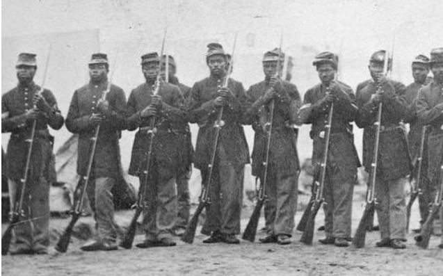
Black Union Soldiers at Port Hudson, Louisiana, 1863.

The Africans escaped their masters and created maroon colonies. On the plantations and in the mountains and swamps surrounding the plantations they also organized slave revolts, the most successful of which was the revolution in Haiti in 1791.