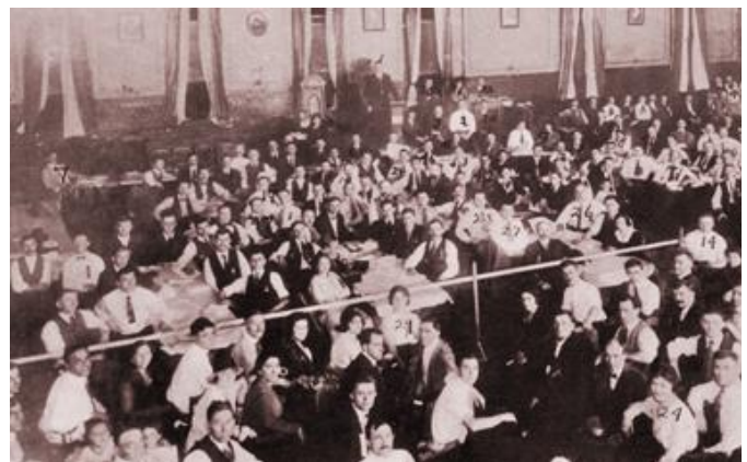
Founding Convention of the Communist Party of America, 1919

The repression of the incipient communist movement was led by Attorney General A. Mitchell Palmer. His chief assistant, J. Edgar Hoover, headed the “anti-subversive” group within the Attorney General’s office, the General Intelligence Division, which later became the notorious Federal Bureau of Investigation (FBI).