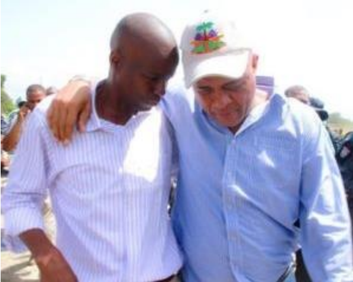
Jovenel Moïse and Michel Martelly, the two PHTK [Parti Haïtien Tèt Kale] presidents united in corruption

With the Tèt Kale regime, this systemic violence has come to a head. Not only are the funds of the public treasury being openly robbed, but also several massacres have been committed by armed gangs in the pay of the government. The results of the massacres in the popular neighborhoods of the metropolitan area of Port-au-Prince are alarming. Hundreds of people have been murdered without their families being able to bury them. In addition, thousands of surviving families have had to take refuge in public places where they are forced to live under the stars.