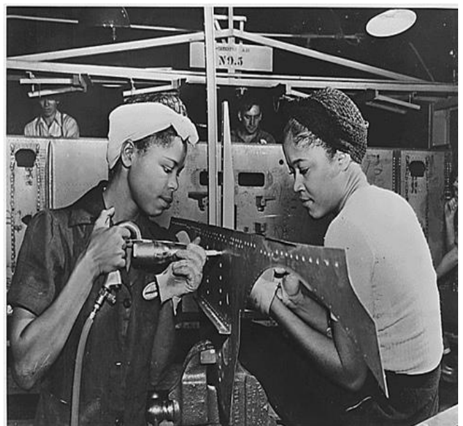
Black women workers at El Segundo Aircraft Plant in Long Beach, CA during World War II

World War I caused the biggest internal shift and fissure in the Black liberation movement. Thousands of black soldiers were exposed to the war propaganda about fighting for freedom and democracy. This caused them to look at the conditions of the Black masses as a whole and to embrace radical trends developing in the world,