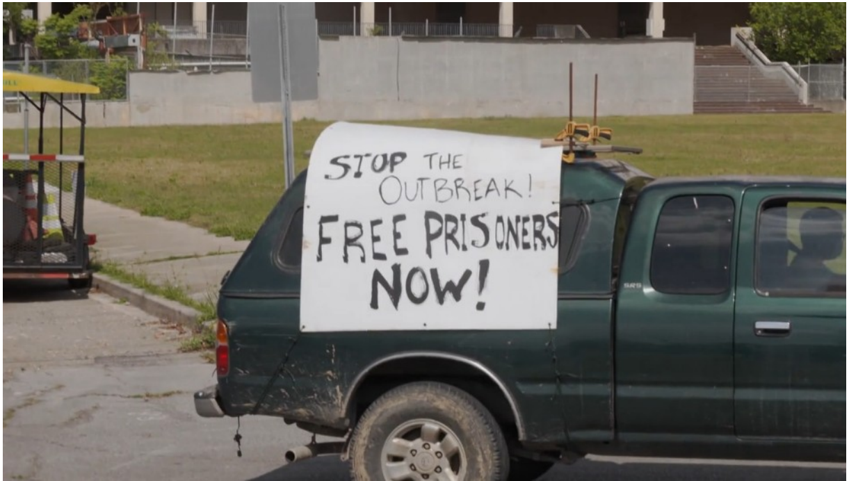
In New Orleans, a car caravan was organized in early April calling for the release of prisoners