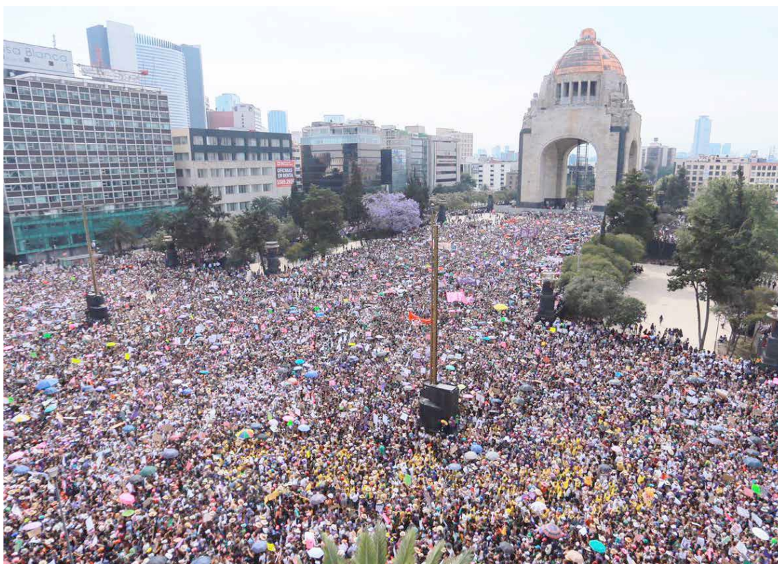
Marcha de Mujeres, Ciudad de México, 2020

¡Ahora es por la Revolución Proletaria! ¡Ahora es por la emancipación de la mujer!