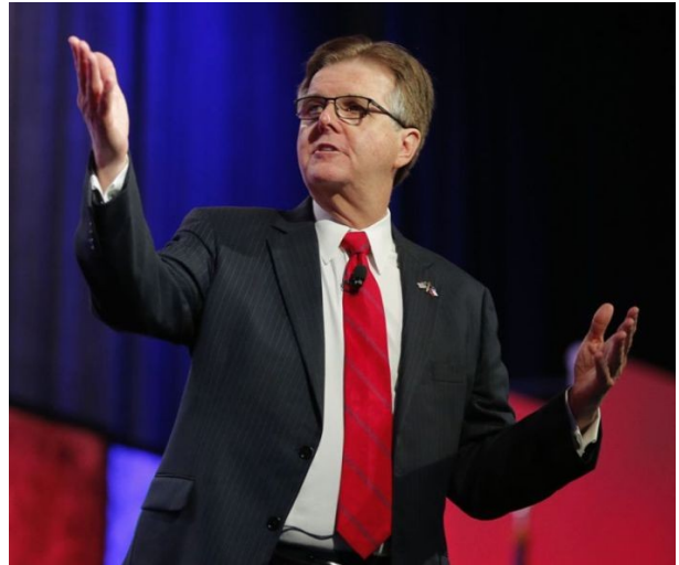
Texas Lt. Gov. Dan Patrick, who recently urged people to “get back to work” to save a flagging economy,

There are two key aspects of this economically-driven death-wish rhetoric that reflect the fascist decay of American capitalism. First, Dan Patrick and many Trumpites reflect the cynical “reason” that was at the heart of 20th fascist barbarity and is the heart of 21st century fascist apologetics. Fascists always seek to portray efforts to prioritize human life at economic or national expense as the product of decadent, weak liberalism that lacks the stomach to achieve true success. Sure, for the Dan Patrick’s of the world, thousands of elderly people will die, but how many, they ask disingenuously, will suffer from an economic recession? Killing thousands for economic gain, in such a construction, is actually good for the country, because it saves many millions from financial destruction. Our fate and the fate of stockholders are the same fate—the age-old Reaganite, trickle-down myth. But who, ultimately, did the American state help in the last recession? Did they offer mortgage relief for those who lost their home? Student loan forgiveness for graduates who couldn’t find a job? No, they offered trillions to corporations. We are asked to risk our lives, the lives of our parents and grandparents, for the good of the nation—but we know from experience who suffers and