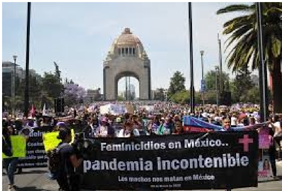
Women's March, Mexico City, 2020

Now is the time for the Proletarian Revolution! Now is the time for the emancipation of women!