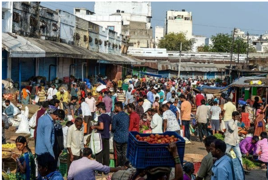
People buying vegetables at a crowded market on Tuesday in Secunderabad, India. Indian Prime Minister Modi has instituted lockdown allowing people to only go to the market for 3 hours (6 AM to (AM).

This will obviously make the markets evenmore crowded.