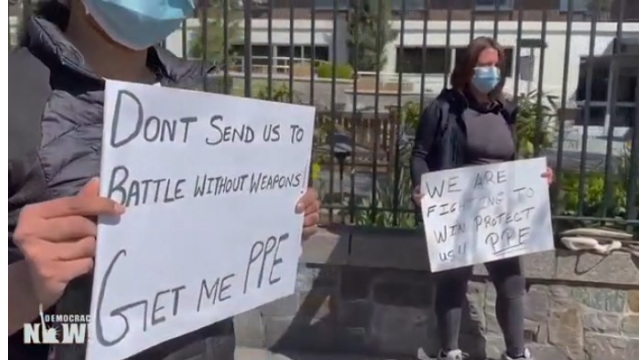
Protest by nurses and doctors at Montefiore Hospital in the Bronx on April 2 demanding Personal Protective Equipment (PPE).

There are many political reasons and consequences for the restrictions that have nothing to do with the coronavirus. Many cities are either on lockdown or have curfews that make it difficult or impossible for people to get together. The Pentagon is sending some military staff to underground bunkers in case normal government functions become impossible. 5 There is discussion of a possi