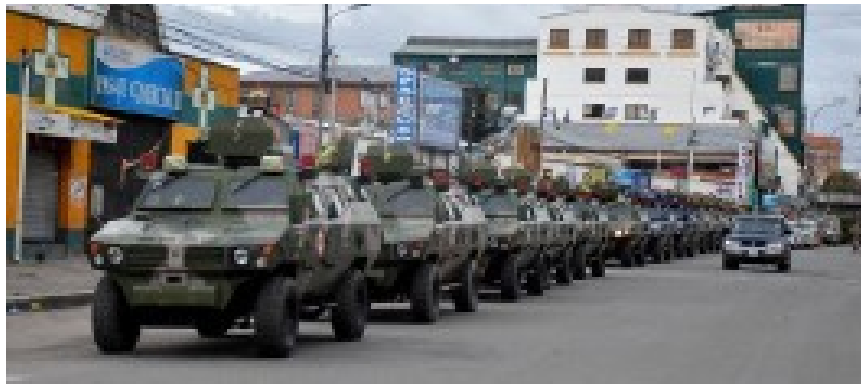
Tanks in the streets of La Paz, Bolivia, ordered in by the fascist coup regime. From Tinta Roja (Red Ink) , Organ of the Revolutionary Communist Party of Bolivia)

We must be unafraid to label a politics that partakes in a cynical reason that happily trades lives for stock gains and seeks to turn workers against each other for corporate gain what it is—fascist. Capitalism, facing a resurgent socialist movement and internal crisis, is turning to its last bastion. As workers, and socialists, it falls to us to press through the anxiety, despair, and isolation many of us are facing, and redress ourselves with new vigor and ingenuity to the task of destroying fascism, once, and for all.