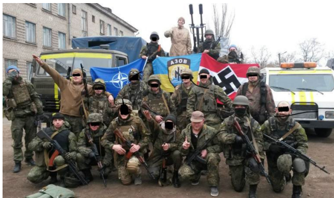
Batallón Azov: amigos de los EE.UU. en Ucrania

En esta rivalidad, todas las fuerzas progresistas en los Estados Unidos deben concentrar nuestro fuego contra nuestra propia clase dominante. Fue los Estados Unidos quien orquestó el golpe de Estado de 2014 que estableció un régimen nacionalista y neofascista en Ucrania. Victoria Nuland, entonces subsecretaria de Estado, se jactó de que los Estados Unidos gastó $5.000 millones para instigar el golpe. Este régimen ha pasado ocho años bombardeando las Repúblicas Populares de Donetsk y Lugansk en la región de Donbass, en el este de Ucrania, matando a unas 14.000 personas allí. Los Estados Unidos también está utilizando la guerra para fortalecer su control sobre sus aliados europeos, particularmente Alemania. Y la invasión de Ucrania por parte de Putin le ha dado a Alemania una excusa para no abrir el gasoducto Nord Stream 2. Esto aumentará los precios del petróleo y el gas no solo para las personas en Europa, sino también para nosotros en los Estados Unidos: el petróleo ya se está vendiendo por más de $4 por galón.